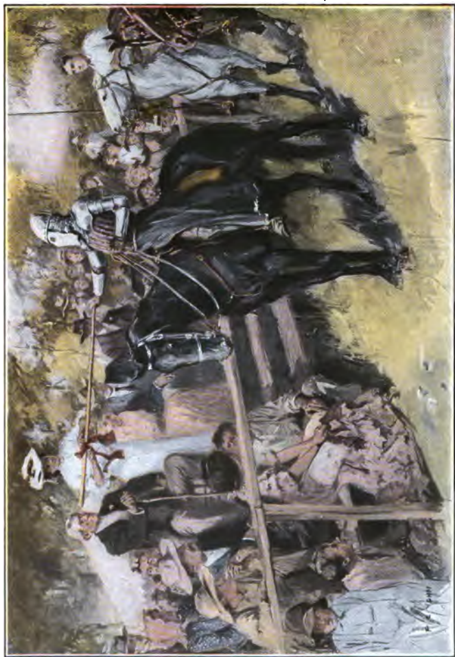
The Knight of the Cumberland reined in before the Blight.